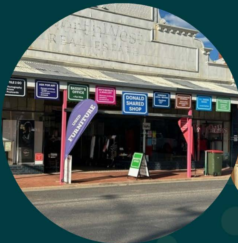
Donald Shared Shop, 81 Woods Street, Donald & Shop Traders

The Shared Shop Trail initiative has commenced looking to establish a network and promote an online presence for up to six shared shops in the north west of Victoria. The theme is focused on the shared shops operating "in the shadows" of local silo art.