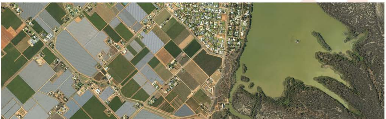
High resolution aerial photography flown January 2024, in colour infrared and natural colour