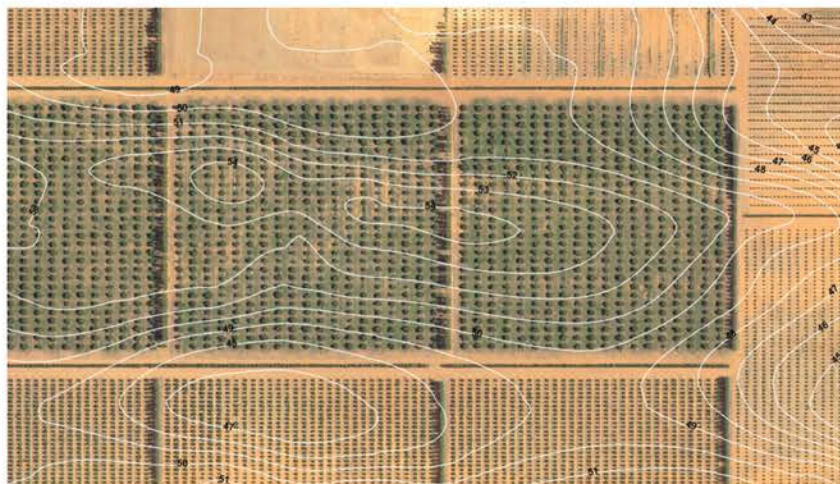
Section of a property map