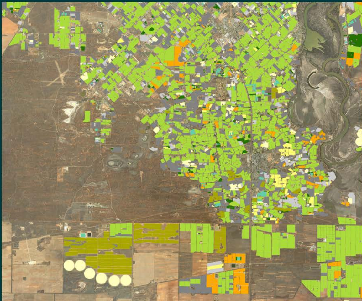
January 2024 aerial photography with 2024 irrigated crops mapping

will be updated for the Murray Darling Basin Authority (MDBA). The report is expected to be publicly available in 2025.